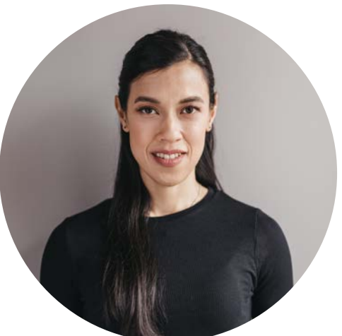
Closing Remarks by YBhg. Datuk Nicol Ann David