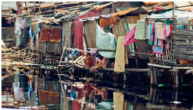
The COVID-19 crisis will create new vulnerable groups and exacerbate existing vulnerabilities.

Finally, structural governance challenges will impede recovery efforts. These include rising inequality, social vulnerability, human rights violations, security challenges, risk communication, and managing uncertainties. Policy makers will also have to think of means to ensure the continuity of production and service lines beyond offering economic incentives, while also minimizing impacts on supply chains and food systems.