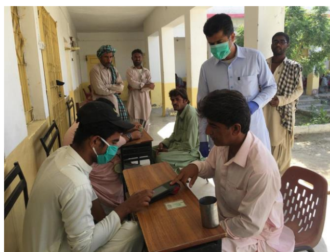
Pakistan's biometric COVID-19 benefits scheme, Ehsaas Emergency Cash, has disbursed roughly US$695 million to nine million households

Instituting digitization of data management systems and digital identities can improve real time access to services and social protection entitlements and ensure that no one is left behind. A digital identity for beneficiaries can create a foundation on which to build new services that are risk-informed and adaptable to the stage of the disaster cycle.