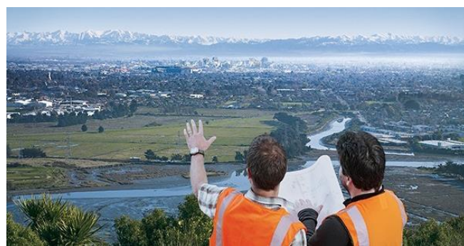
New Zealand's COVID-19 Response and Recovery Fund has set aside NZ$3 billion to fund infrastructure projects across the country.

The COVID-19 crisis has amplified the growing calls for resilient and adaptable infrastructure that can effectively operate during moments of crisis. As countries plan for recovery, they should invest in infrastructure projects that offer the opportunities to address short-term job losses and longer-term resilience and decarbonisation objectives at the same time.