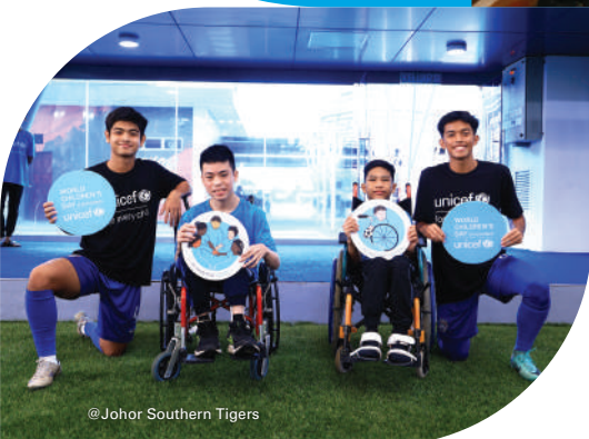
@Johor Southern Tigers

Another notable initiative was the Kick for Inclusion football clinic , conducted in collaboration with Johor Darul Ta'zim Football Club to promote inclusivity. Seventy children, aged 7 to 17, with and without disabilities, took part in this programme.